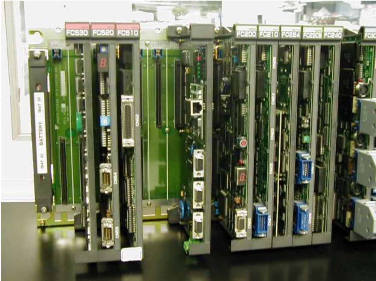
A Yasnac i80 Model A with our MxI80 Memory Card installed in the center slot labeled FC120 (with the 3 DB9 Ports and the Ethernet Port and no label at the top).

Note: To enable the Ethernet connection on our MxI80 board (and to set up the serial port COM1 for connection to the Yasnac Port A) please consult the UMI installation manual. Use the utility “LocateIP” found on our web site or on the NetDNC CD in the 100 Utilities folder.