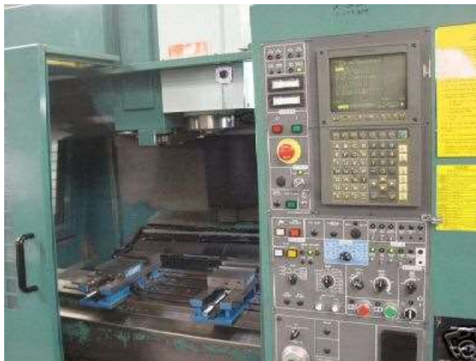
A Yasnac i80 Version A Controller